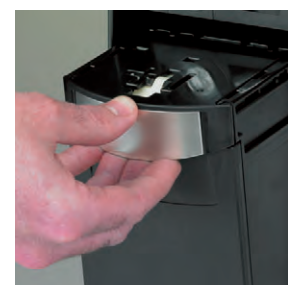
Extraction of note cashbox