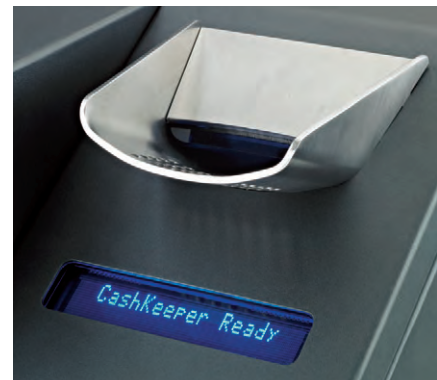
Integrated visor display of high luminosity