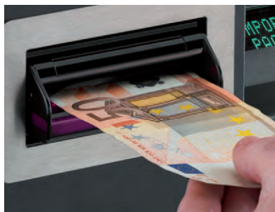
Only accepts authentic notes