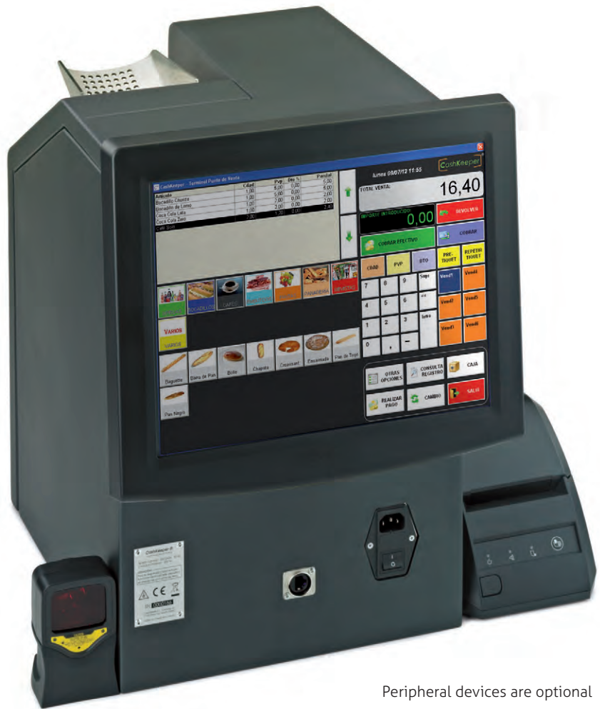
Peripheral devices are optional