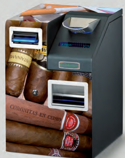
Magnetic advertising displays