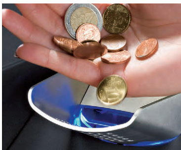
Accepts and verifies 3 coins per second