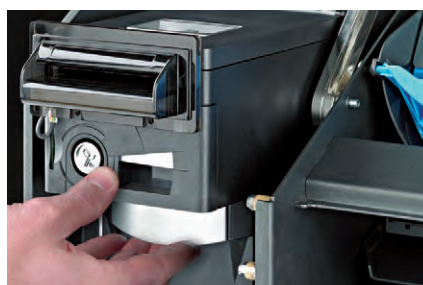
Unblocking mechanism of the drawer